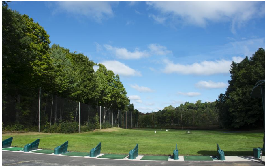
Figure 5: Country Club Driving Range Improvements

The Groton Country Club driving range (see Figure 5 ) benefits from major improvements including new poles and netting that allow any use of any club, new range mats, and a new range picking machine for improved ball retrieval. The Country Club request for $47,000 was approved at the 2015 Spring Town Meeting.