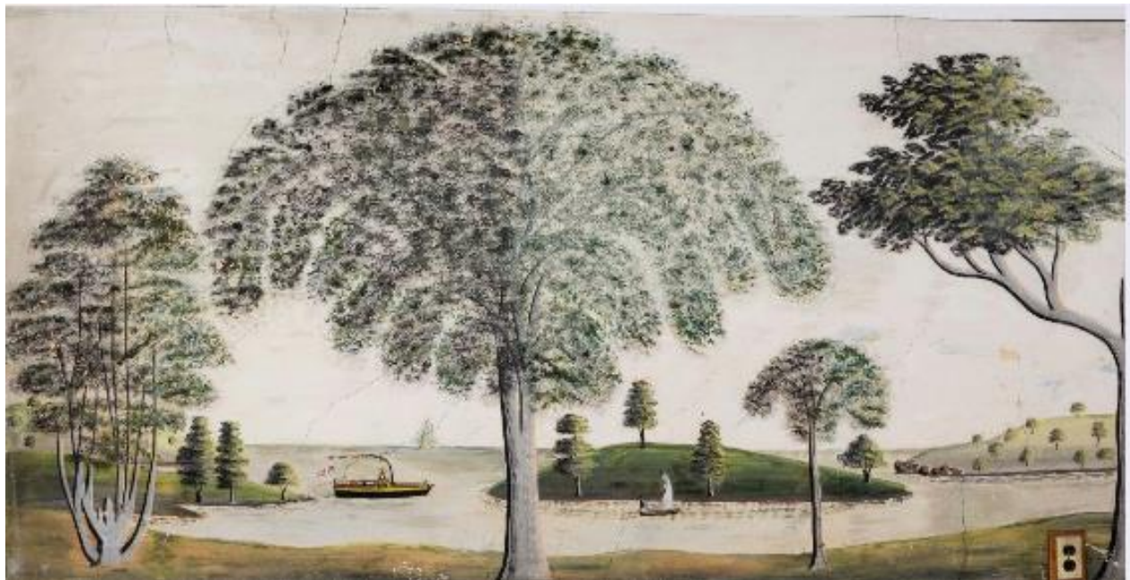
Figure 12: J.D. Poor Mural

Finally, the murals were created by David Ottinger and transported to the Groton Inn on May 5, 2019. The murals are now on display in The Groton Inn lobby, accessible for easy viewing by Town residents and visitors. These Poor murals will have the distinction of being the only ones in Groton available for the general public to view.