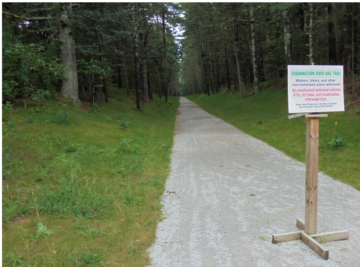
Figure 15: Squannacook River Rail Trail – 1 st Phase

Work on Groton's first phase of the Squannacook River Rail Trail was completed in the spring of 2023. This 0.6-mile section, see Figure 15 , connects the Peter Bertozzi Conservation Area to the northern crossing of Crosswinds Drive in West Groton. Groton's 0.3-mile second phase, scheduled to start in the fall of 2023, will extend the trail to the Groton-Townsend town line and connect to the 2.5 mile section of the trail under construction in Townsend.