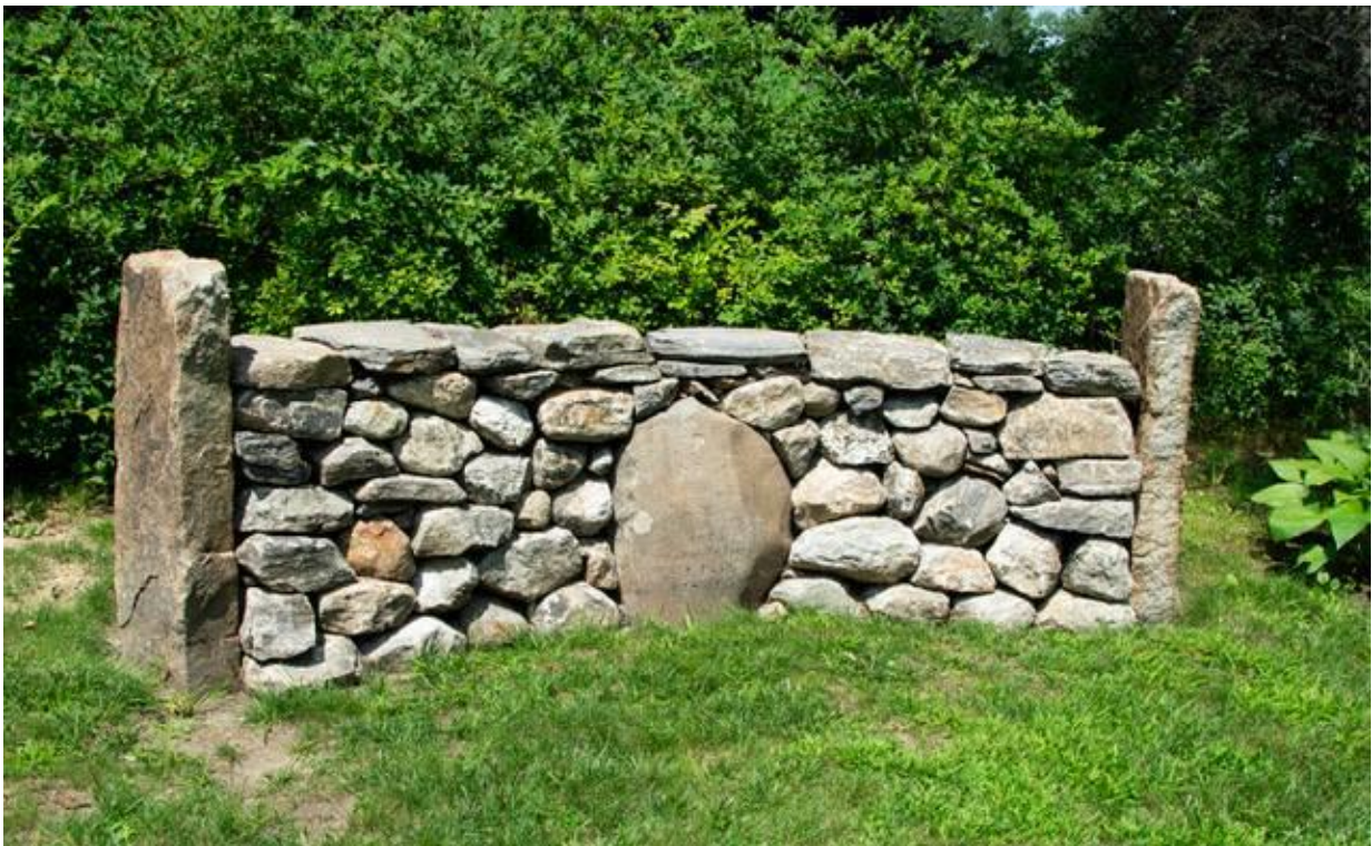
Figure 14: Prescott Stone in G.H.C Stonewall

The Prescott Stone is currently located in a stonewall on the grounds of Groton Historical Society, preserved thanks to the generous support of the citizens of Groton through Community Preservation Funds. See Figure 14 .