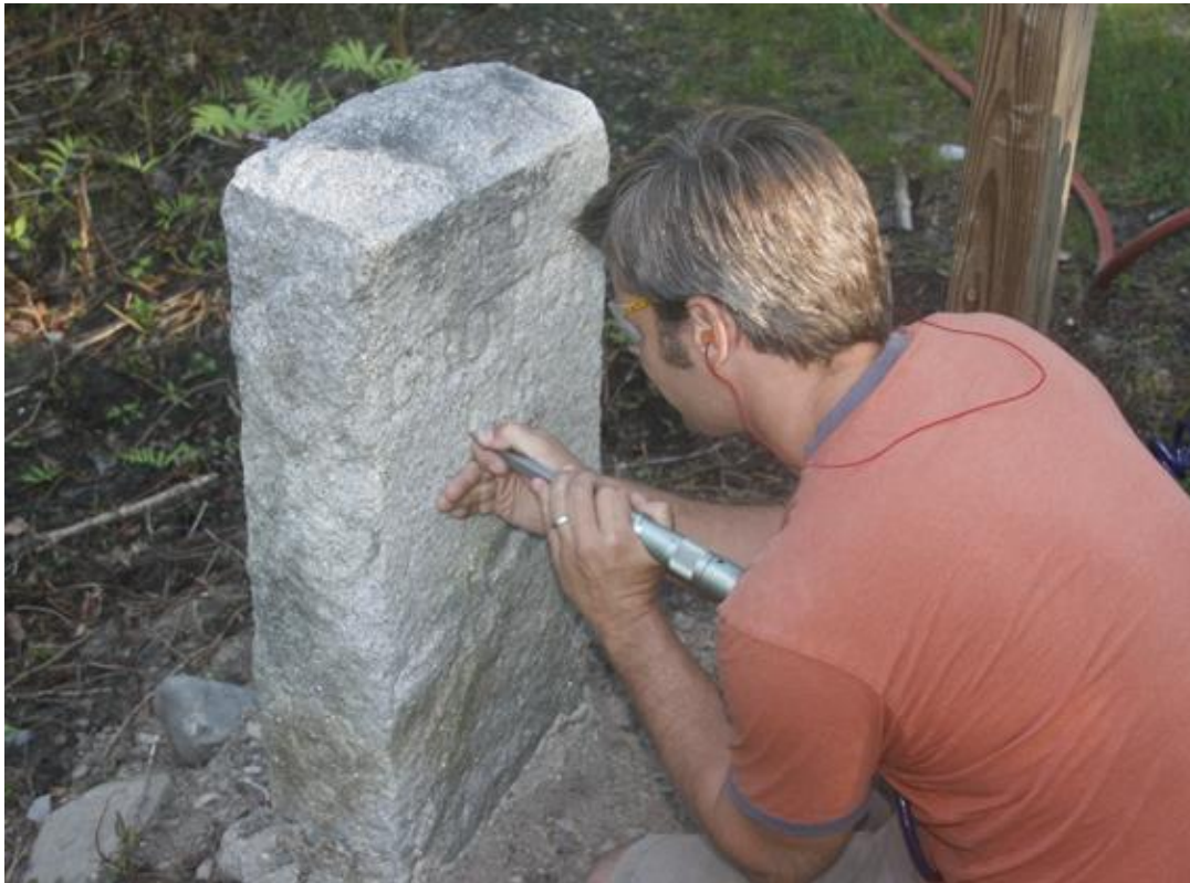
Figure 9: Milestone Restoration