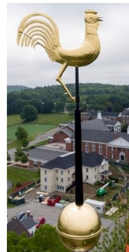
Figure 7: First Parish Restoration – Buddy Installation